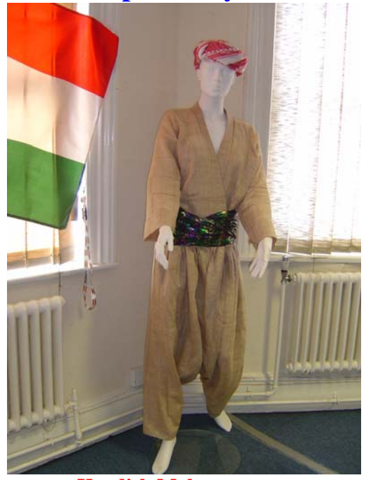
Kurdish Male costume