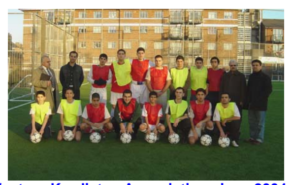
Kurdistan Football Club established by Western Kurdistan Association since 2004