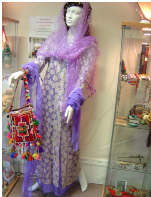
Kurdish ladies dress

The first Museum for the Kurdish Heritage in the world, its collections are Kurdish handwork and some of them are up to 100 years old