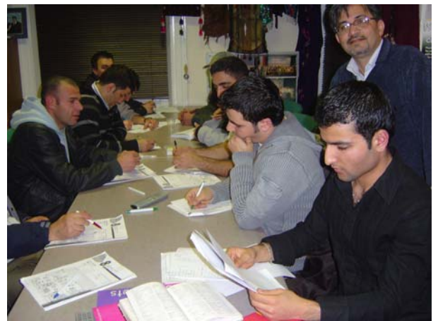
Free English and computer courses for refugees at Western Kurdistan Association