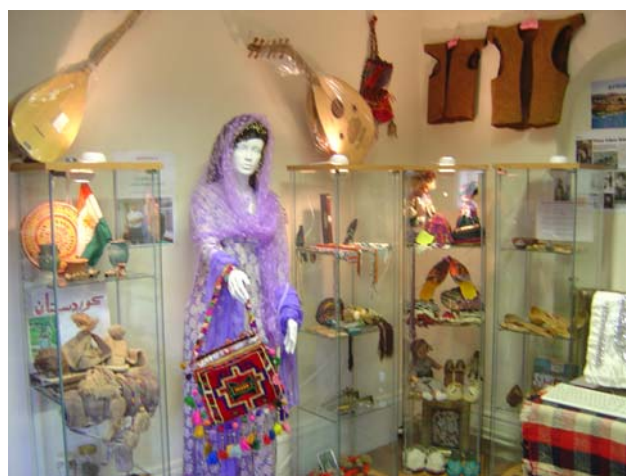
The Kurdish collections at the Kurdish Museum