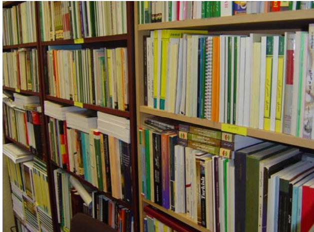
The Kurdish Library and Archive

The first Museum for the Kurdish heritage in the world is one of the main culture resources for the school-age children of Hammersmith and Fulham Borough and to the academics and researchers in the UK. Let's make Hammersmith and Fulham Borough more colourful and tourist area for all nations and for the 3 million Kurds living in Europe for the coming London Olympics on 2012.