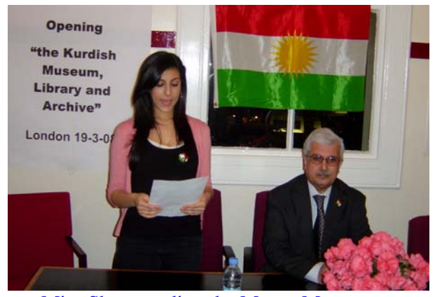
Miss Sham reading the Mayor Message